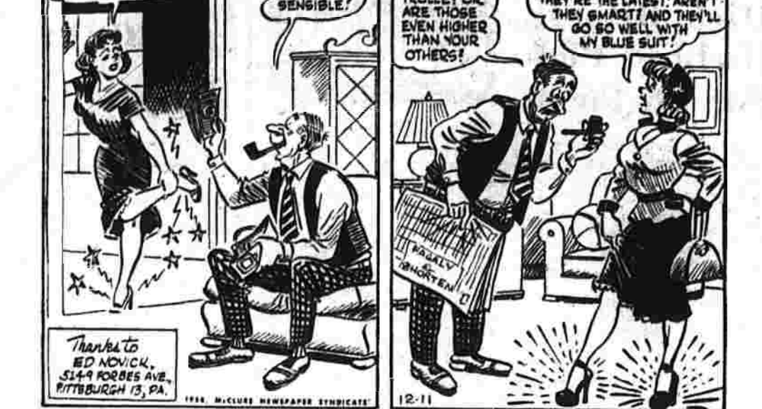
THESE HOUSEHOLD APPLIANCES ARE SO CONVENIENT...